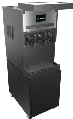
Shown with Optional Cart