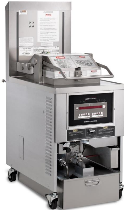
PFG 691 high volume gas pressure fryer

Henny Penny first introduced commercial pressure frying to the foodservice industry more than 50 years ago. Frying under pressure enables lower cooking temperatures for longer oil life, and faster cooking times to meet peak demand. Pressure also seals in food's natural juices and reduces the amount of oil absorbed into product.