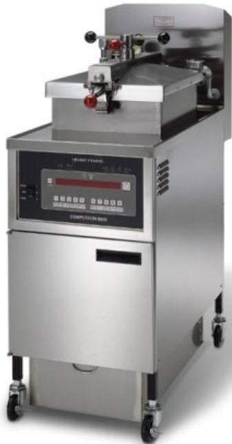
PFG 600 gas pressure fryer with Computron™ 8000 control

Henny Penny first introduced commercial pressure frying to the foodservice industry more than 50 years ago. Frying under pressure enables lower cooking temperatures for longer oil life, and faster cooking times to meet peak demand. Pressure also seals in food's natural juices and reduces the amount of oil absorbed into product.