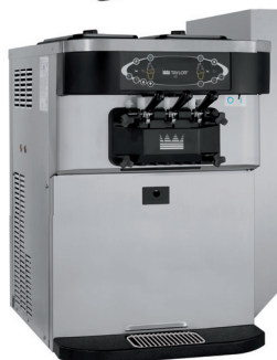
Shown with optional top air discharge chute.