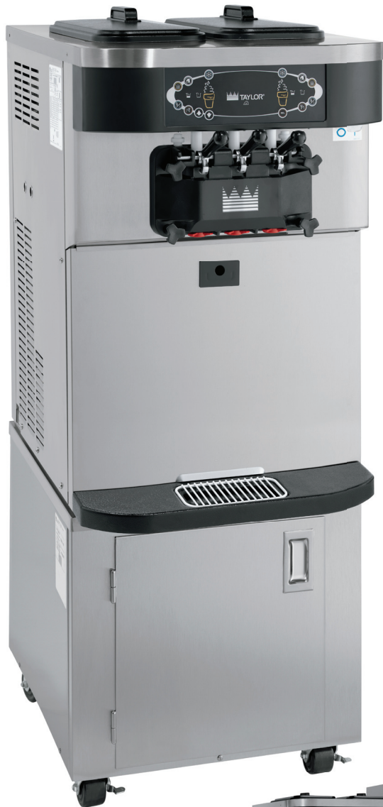
Shown with optional standard height cart.