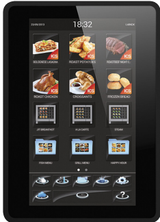
LCD 10" Touch Screen