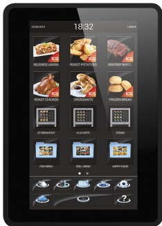
LCD 10" Touch Screen