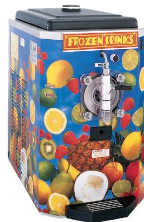
Shown with optional panel decals