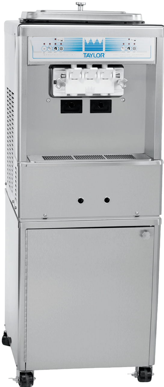
Photo shows Model 161 with optional cart

Protects the operator from injury as the beater will not operate without the dispensing door in place.